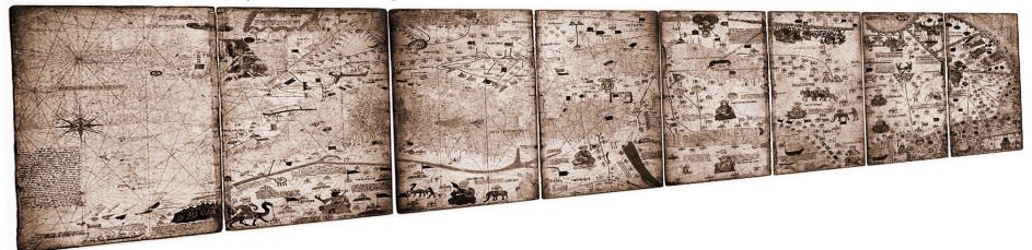
1375, Catalan Atlas made by Abraham Cresques